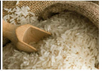
Pusa Sella Basmati Rice