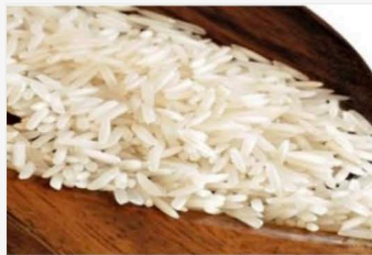
PR-11 Sella Rice