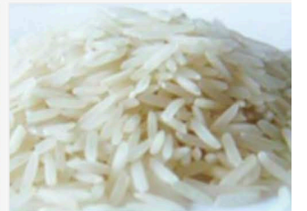
IR-64 Sella Rice