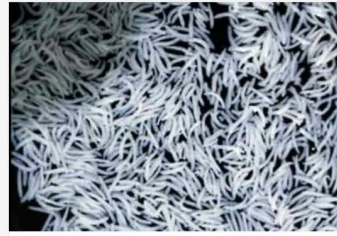
1401 Steam Basmati Rice