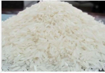
Abukass Basmati Rice (Cup brand quality)