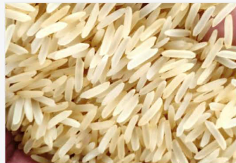
Sugandha Sella Basmati Rice