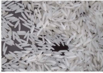
1401 Sella Basmati Rice